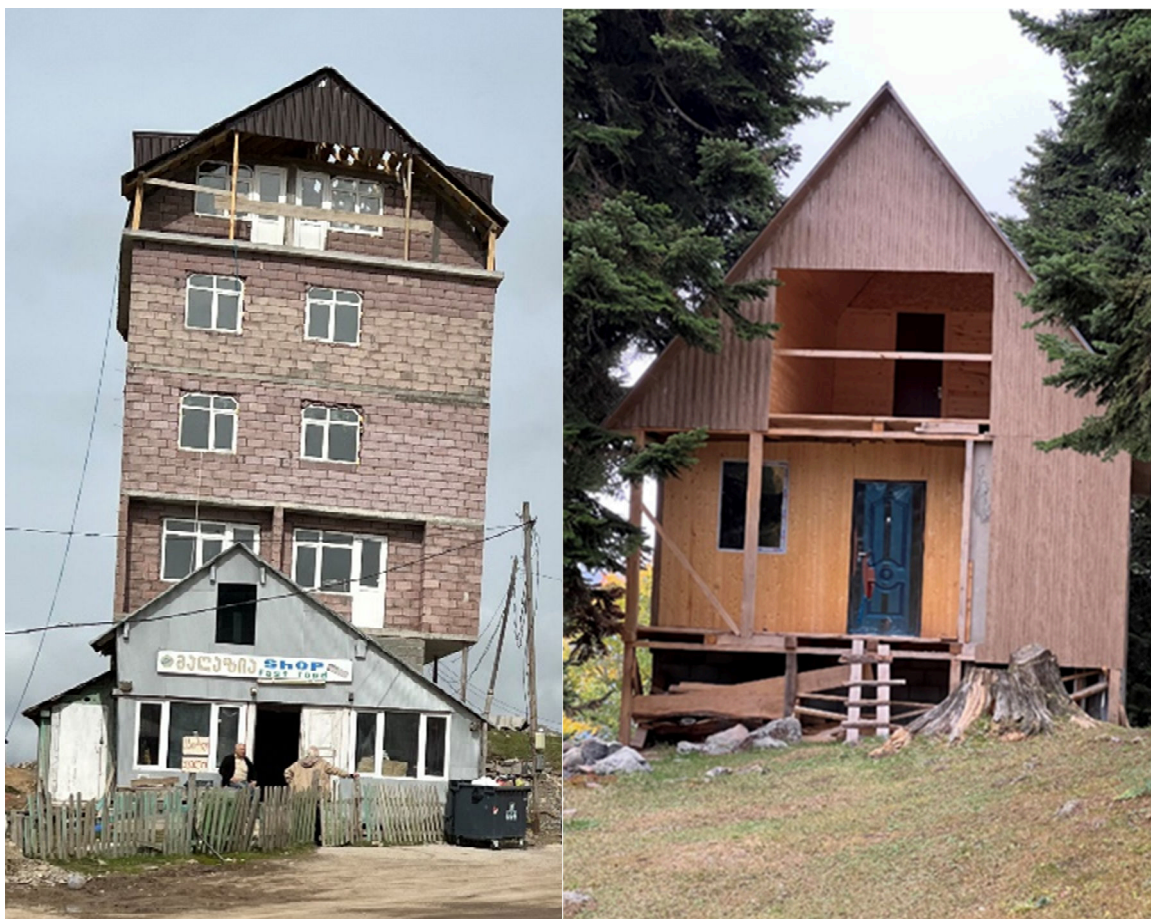
Photo 1 An Example of ongoing local construction on Goderdzi Pass, September 2022